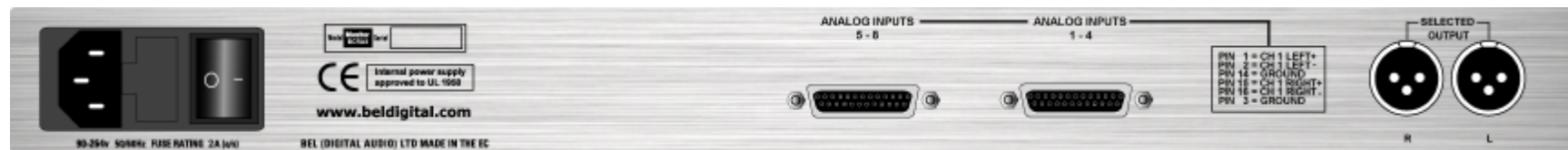
Fig 1.2 BCR-A8 Rear panel