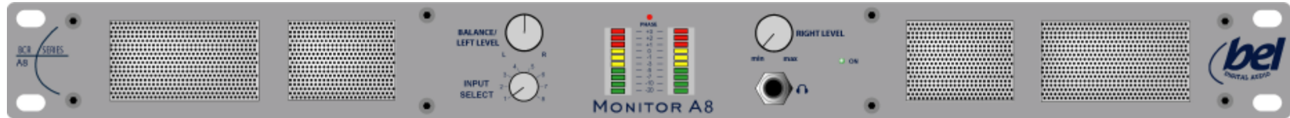
Fig 1.1 BCR-A8 Front panel