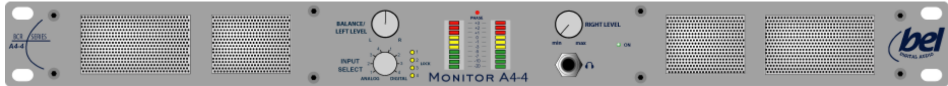
Fig 1.1 BCR-A4-4 Front panel