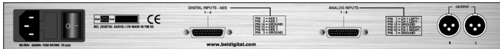
Fig 1.2 BCR-A4-4 Rear panel