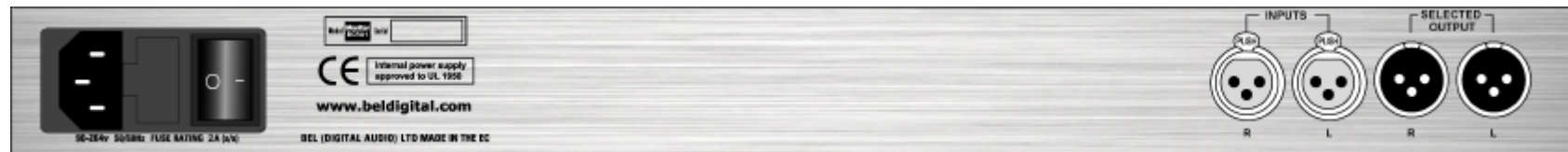
Fig 1.2 BCR-A1 Rear panel