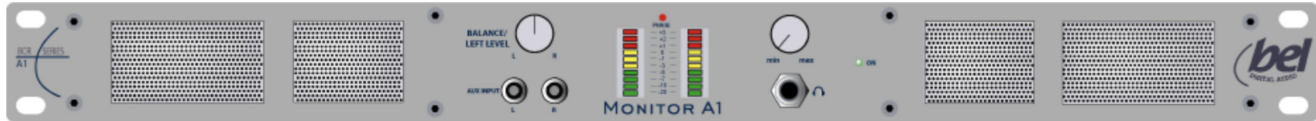
Fig 1.1 BCR-A1 Front panel